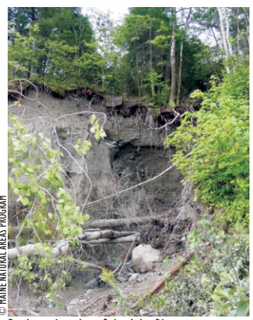
Bank erosion along Saint John River

Leave trees standing at the top of river banks to help keep shorelines naturally shaded and stabilized. Respect guidelines on riparian buffers in order to protect the integrity of river banks. Learn how to identify this species and report any sightings to the New Brunswick Department of Natural Resources.